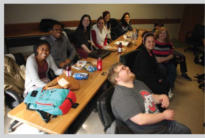
OSU STUDENTS PARTICIPATE VIA VIDEOCONFERENCE IN “NORTH KOREA, BEYOND IMAGES” COURSE.